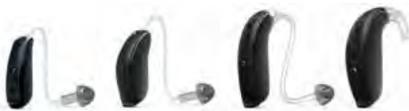
NEW FULL RANGE OF HEARING AID DESIGNS

Modern, discreet and durable, ReSound LiNX2™ hearing aids are available in a full range of designs and colours. So when it comes to comfort and lifestyle, you're sure to find the perfect fit.